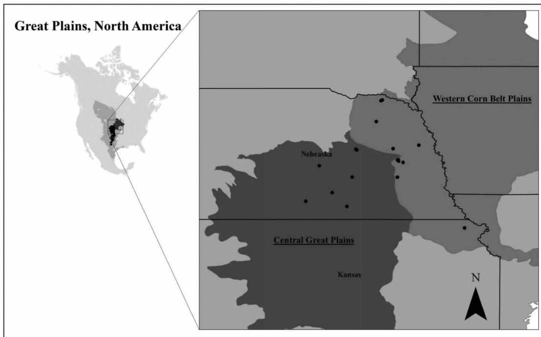
Figure 1. Study regions and farm locations in the Great Plains of North America. Points represent participating farms.